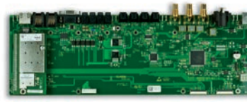
Digital Input Board

Retail Price $1,500 Description For original SSP-800 and CT-SSPs equipped with HDMI 1.3. The upgrade eliminates two S-Video inputs and adds a fifth HDMI input. All inputs and outputs are full-featured HDMI 1.4. Dual DSP board must be installed to accommodate the HDMI 1.4 kit.